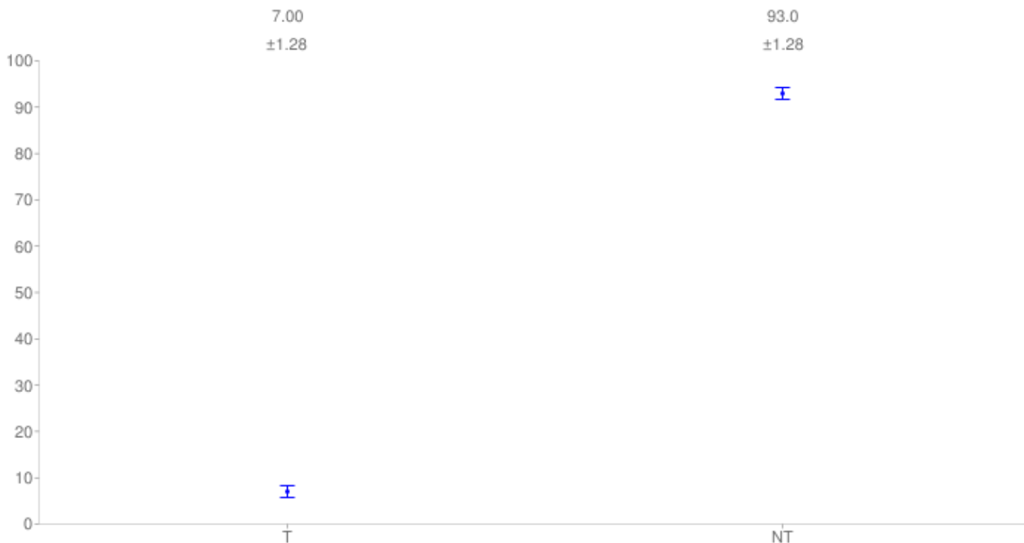
Percent Cover ( \pm SE)